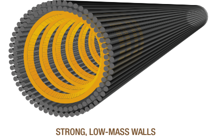
STRONG, LOW-MASS WALLS ARE MADE POSSIBLE USING ARC TECHNOLOGY

AN INNER CORE OF REINFORCING ARC TECHNOLOGY